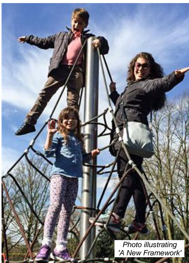
Photo illustrating 'A New Framework'

Mission and unity are integral parts of being the church, so the finalising of A new framework for Local Mission in Unity in March and the work on A guide to understanding 'A New Framework' with National Ecumenical Officers colleagues provides a resource for wider and more collaborative ecumenical mission activity. It should enable a much looser, nimbler enabling of ecumenical mission objectives.